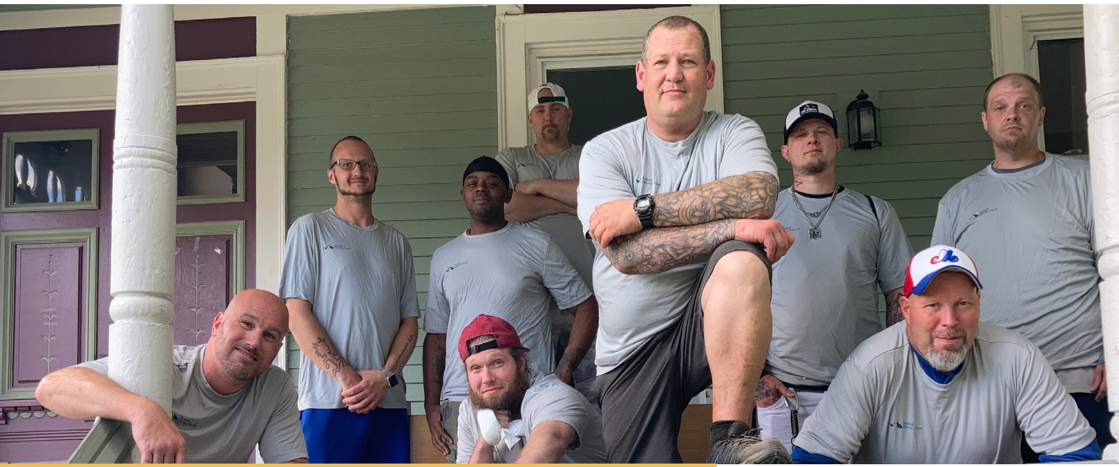
Front Porch. Rutland Dismas House

Reconciling Former Prisoners with Society, and Society with Former Prisoners, Since 1986